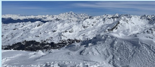
Scenic Overlook by Mike DiProspero

We stayed at an all-inclusive ski-in/ski-out resort - Club Med in Val Thorens. Each morning we woke to an all-you-can-eat breakfast and then met our French Ski School guide for morning skiing. At lunchtime we would return to the hotel where we were welcomed