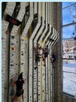
Rock Climbing by Mark Metzler

We stayed at an all-inclusive ski-in/ski-out resort - Club Med in Val Thorens. Each morning we woke to an all-you-can-eat breakfast and then met our French Ski School guide for morning skiing. At lunchtime we would return to the hotel where we were welcomed