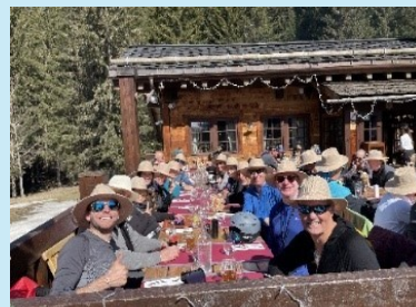
Lunch on the Slopes